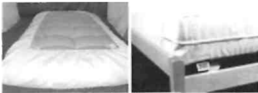
Barrier mattress cover Barrier cloth mattress sack (Upside down for picture)